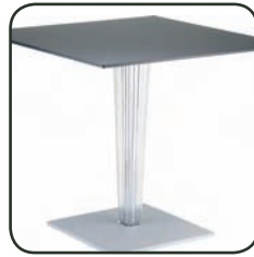
Square on Single Leg