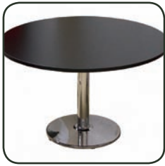
Round Disc Base