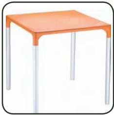
Square 4 Leg