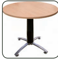
Round, Double Ped Leg