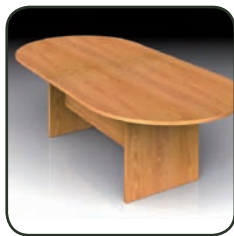
'D' End Table