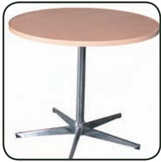
Round, Pedestal Leg