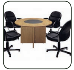
Round, Cross Base