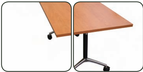
i-Flip / Tilt