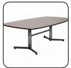
Twin Pedestal Table