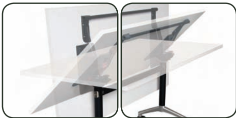
i-Flip / Tilt