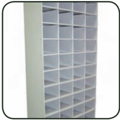
Pigeon Hole Unit