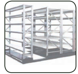
Active Rola File Shelves