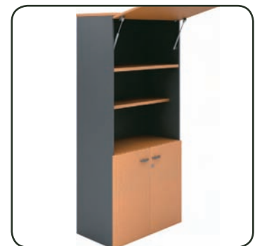
Flipper Door Tall Shelving

This is just a snapshot of the selection of Shelving Units available in our range. Please call our office or visit our website and download a PDF, for a complete picture of this extensive range.