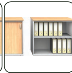
Low Laminate Shelving