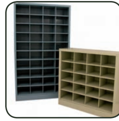
Metal Pigeon Hole Units