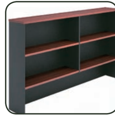
Open Hutch Unit