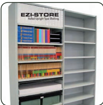
Open Metal Shelving