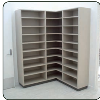
Corner Storage Shelf