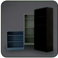
Various Metal Shelves