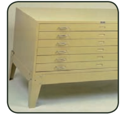
Horizontal Plan Cabinet