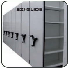
Ezi-Glide Heavy Duty