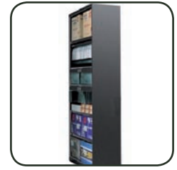
Open Shelf Storage