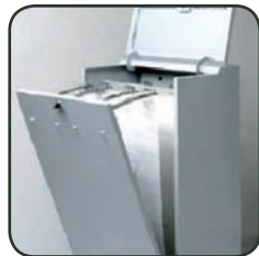
Verti Plan Cabinet