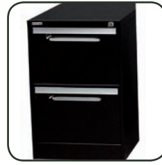
2 Dr Filing