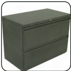
2 Dr Lateral Filing