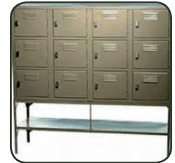
Bank of Lockers