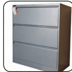
3 Dr Lateral Filing