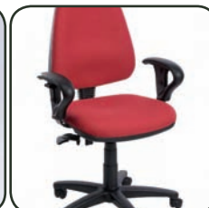
Omega High back Adj. arm rests