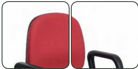
Omega Low back