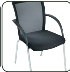
Nebula 4 leg